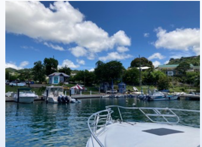
Approach to Dinghy Dock