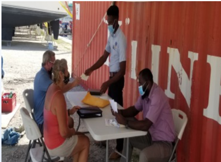
Under White Health Screening Tent

On arrival, anchor then go to the Tyrell Bay Boatyard and Marina for your arrival Health Screening