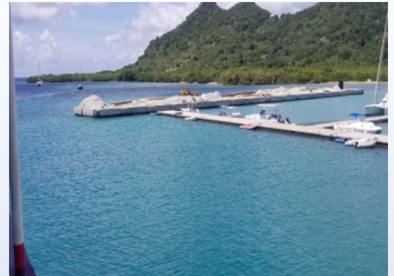
Approach to Dinghy Dock