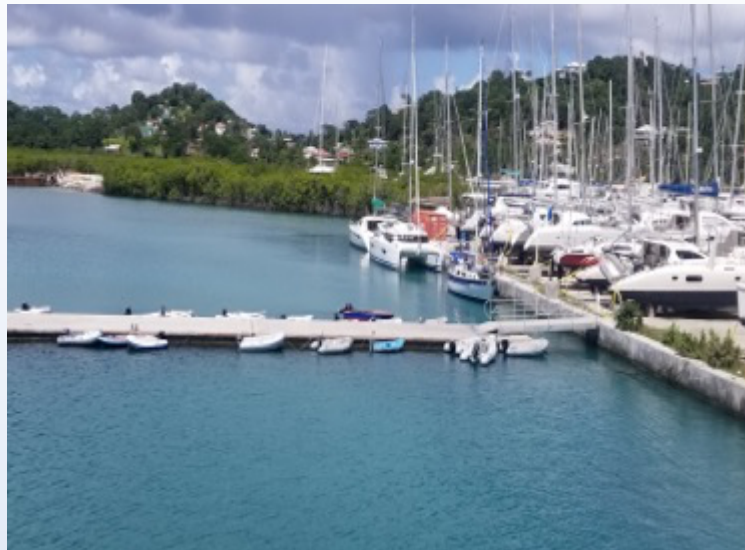
Dinghy Dock with Tent/Trailer at Far End Right