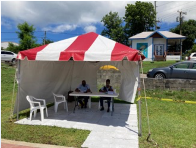
Health Screening Tent

On arrival, anchor then go to Grenada Yacht Club for your arrival Health Screening